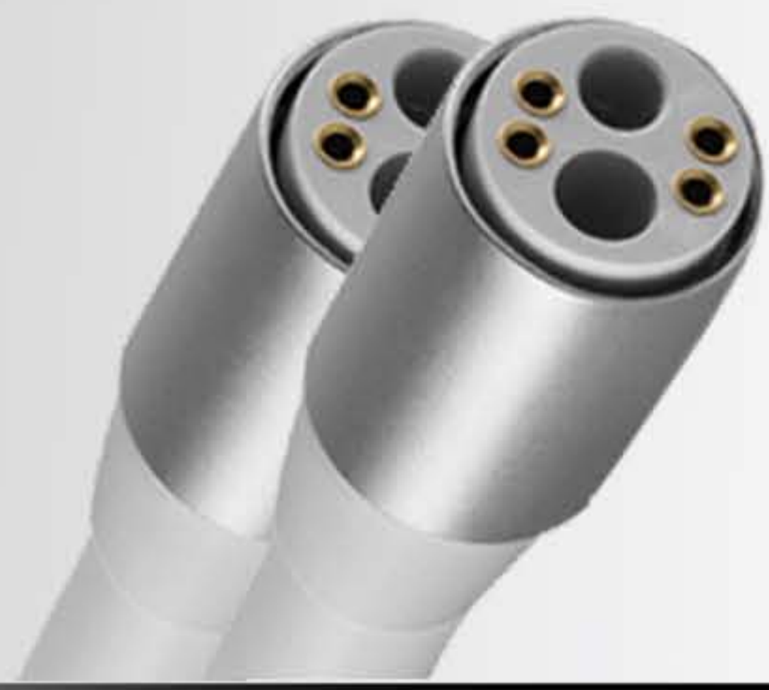
2 Fibre optic terminals except in versions Personal I and Personal IH