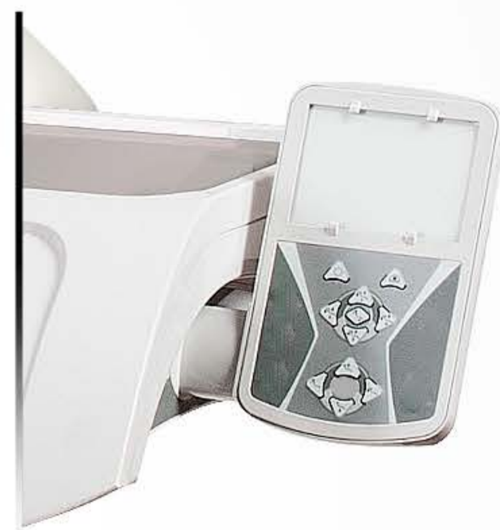
Control pad with negatoscope