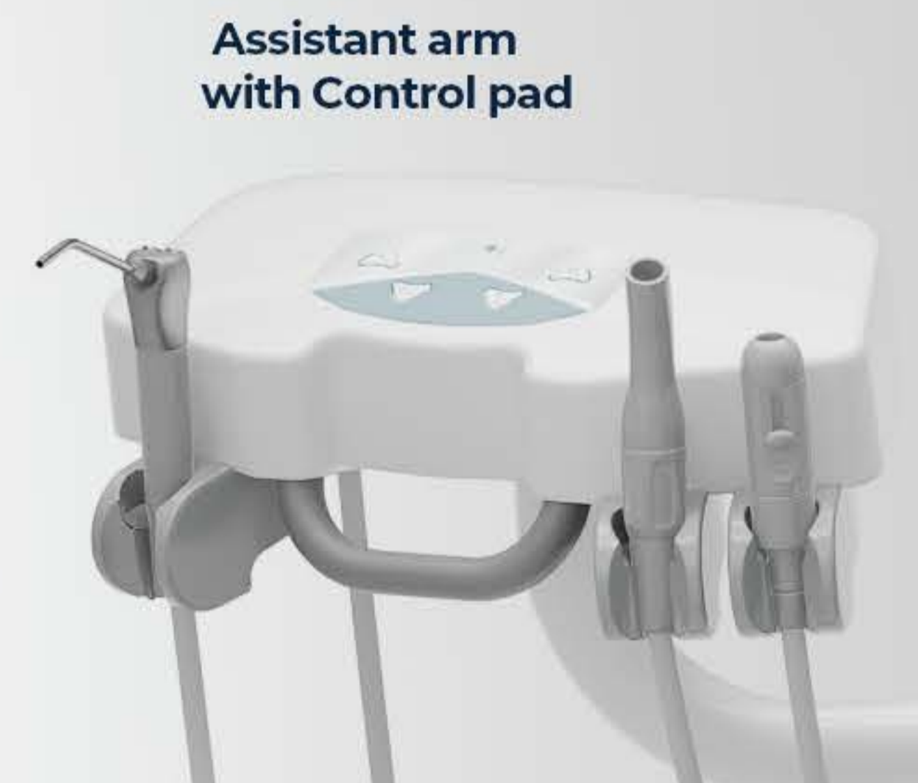
Assistant arm with Control pad