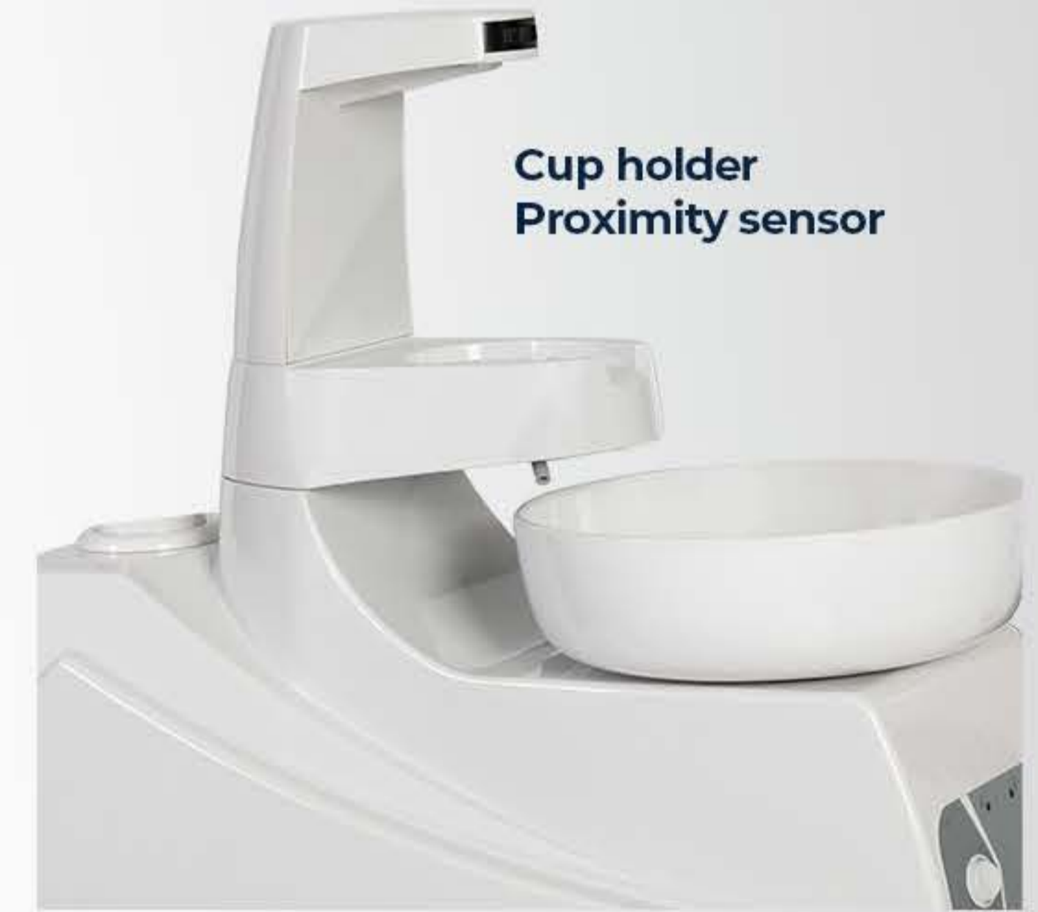
Cup holder Proximity sensor