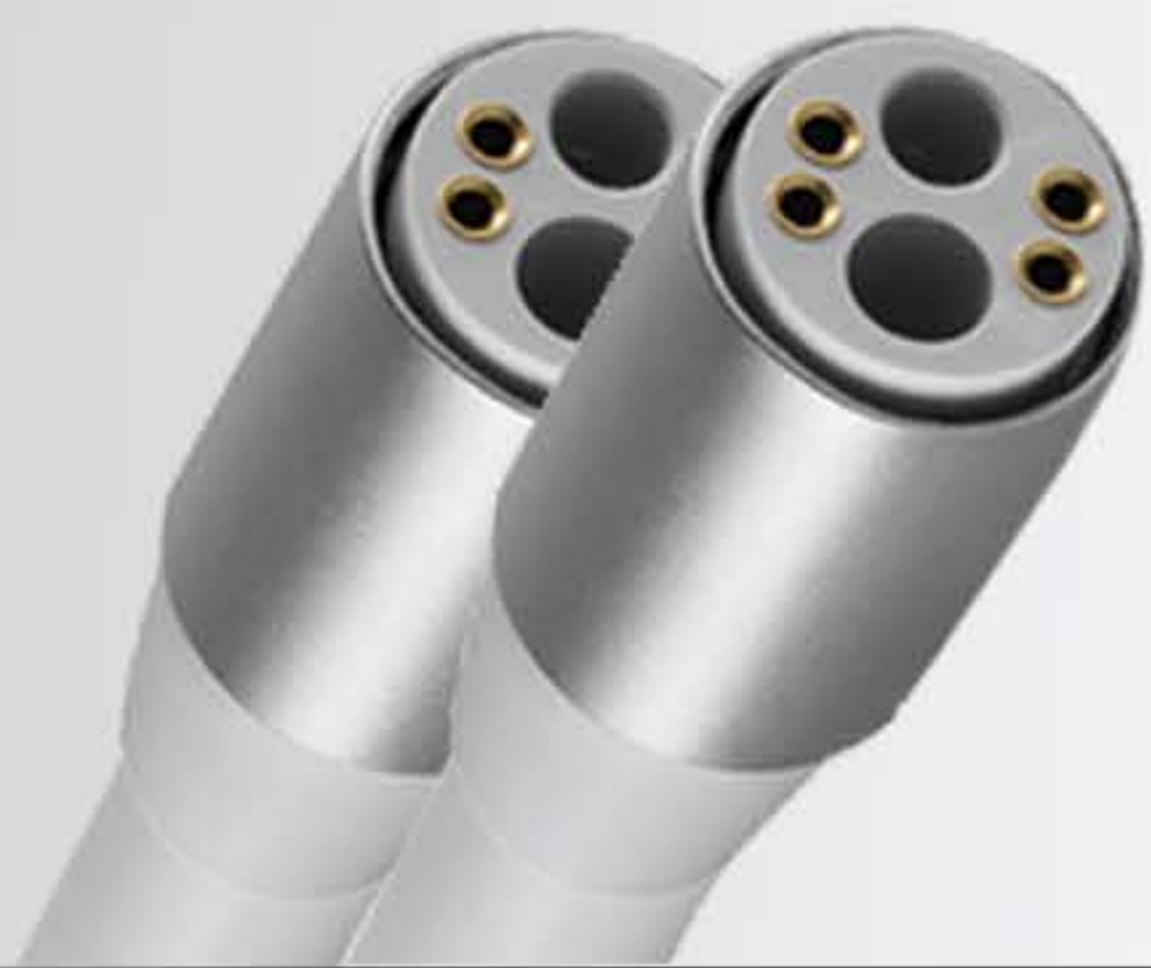
2 Fibre optic terminals