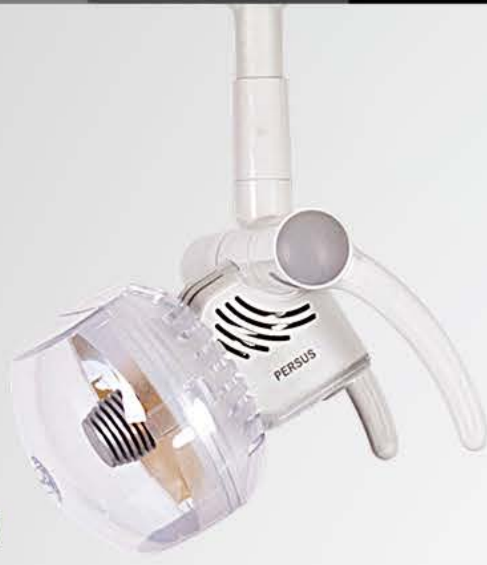
Persus Dental Light (LED light)

Monofocal for dental use with 1 LED optical system Multifaceted mirror with multicoating treatment Double protection of the mirror, in resistant, transparent material Bilateral handles in the shape of a handle which enable isolation, avoiding the risk of cross contamination Head made of resistant material, 620° swivel